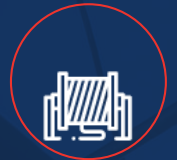
Cable sealing end platforms